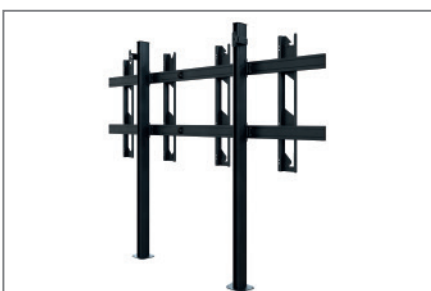
Low space requirement thanks to floor-wall mounting