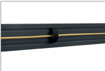
Cable routing with clips

In addition to the pre-configured systems, HAGOR offers customised special solutions in the LED sector, which can be individualised with accessories such as loudspeakers, controls and so on to meet all requirements.